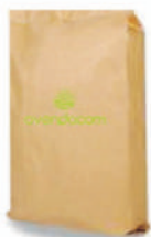
Kraft paper bag: 25kg / 55Lb