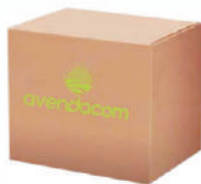
Box: 20kg / 44Lb