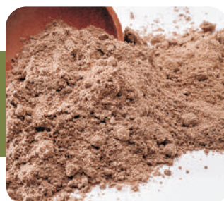
Gelatinized Flour of canihua