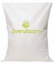
Polypropylene Bag: 25Kg / 55Lb