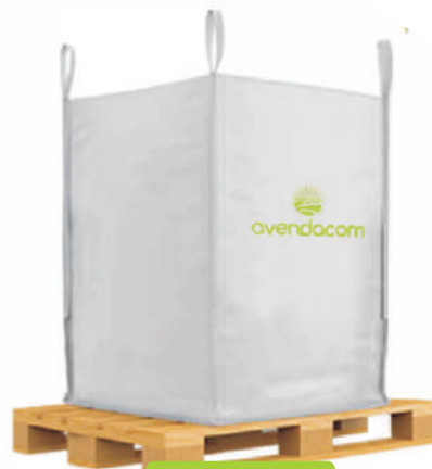
Big Bag: 1 Tm